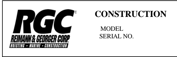
Figure 2-1. Typical HydraPak Product Nameplate

It is important to identify your HydraPak completely and accurately whenever ordering spare parts or requesting assistance in service. The HydraPak has a product nameplate that shows the model and serial numbers as shown in Figure 2-1. Record the model and serial numbers for future reference.