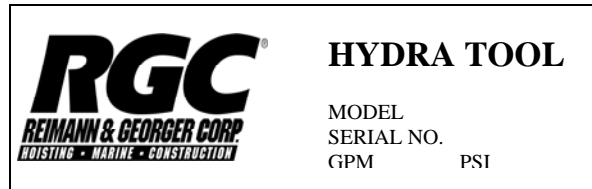
Figure 2-2. Typical Pump Product Nameplate

It is important to identify your pump completely and accurately whenever ordering spare parts or requesting assistance in service. The pump has a product nameplate which states the model and serial number. The pump label should appear as the sample nameplate shown in Figure 2-2. Record the model and serial numbers for future reference.